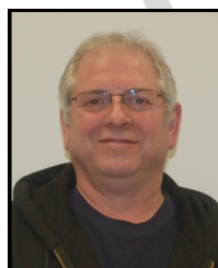
Ross Russell Waste Management 604 520-7903